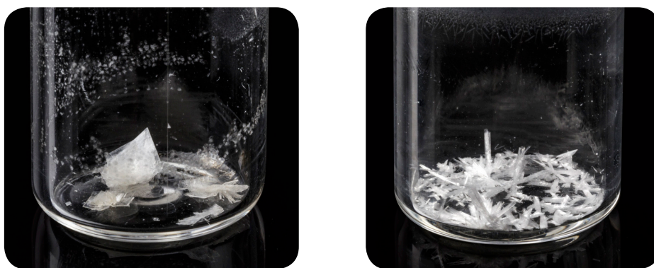
Ibuprofen crystallised from acetone (L) and ethyl acetate (R)

EXALT enables a wide range of solvents to be evaporated all at the same time, and at the same slow rate. Therefore, DCM and Toluene can be placed in the same system and evaporated such that both samples dry at the same time. EXALT may be used for solvents with a boiling point of 40°C to 165°C – DCM to DMAc. The evaporation time can be controlled to range from 6 hours to 72 hours, or more, as required for most solvents in this boiling point range. The system can deliver polymorphs of a chemical at the same time, in a controlled reproducible way.