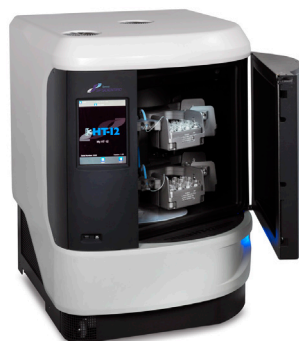
HT-12 Series III