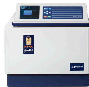
HT-4X Series II