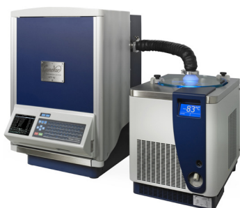
HT-8/12 Series II

EXALT has been shown to be a useful tool for confirmation of stable forms, to create crystals from amorphous forms, to screen solvents for crystal production including production of seed crystals, and in co-crystal screening.