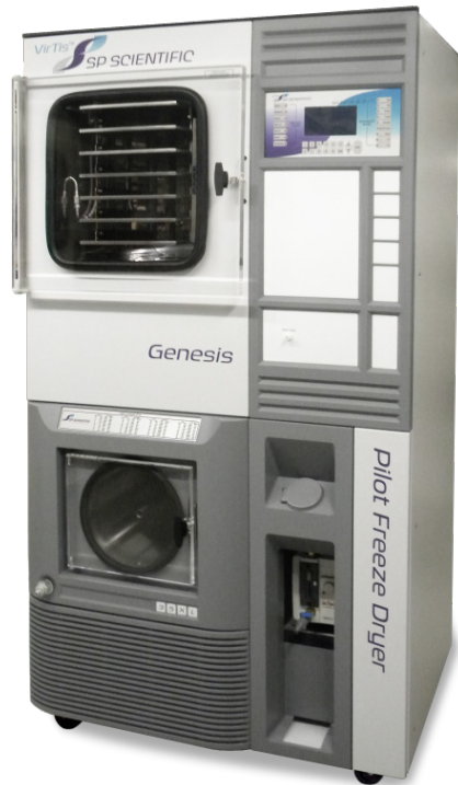
(Standard configuration Genesis 35L shown)